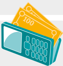
PREPAID AIRTIME/ ELECTRICITY