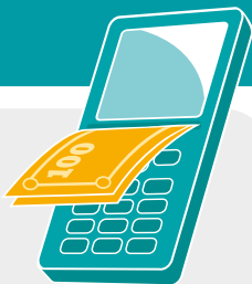
CARDLESS CASH WITHDRAWALS