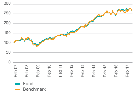
Inception cumulative performance graph based to 100

The portfolio will invest a minimum of 35% of the portfolio in Namibian assets with the remaining assets, up to 65%, to be invested in the other Common Monetary Area (CMA) and the maximum allowable offshore.